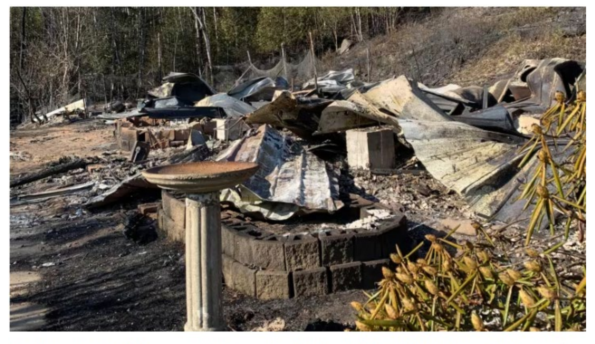
near Saint Andrews.