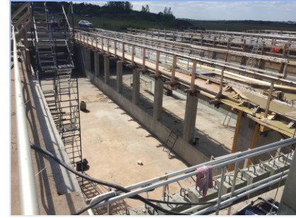
Long Term Capital Expenditure 2019 - 2033