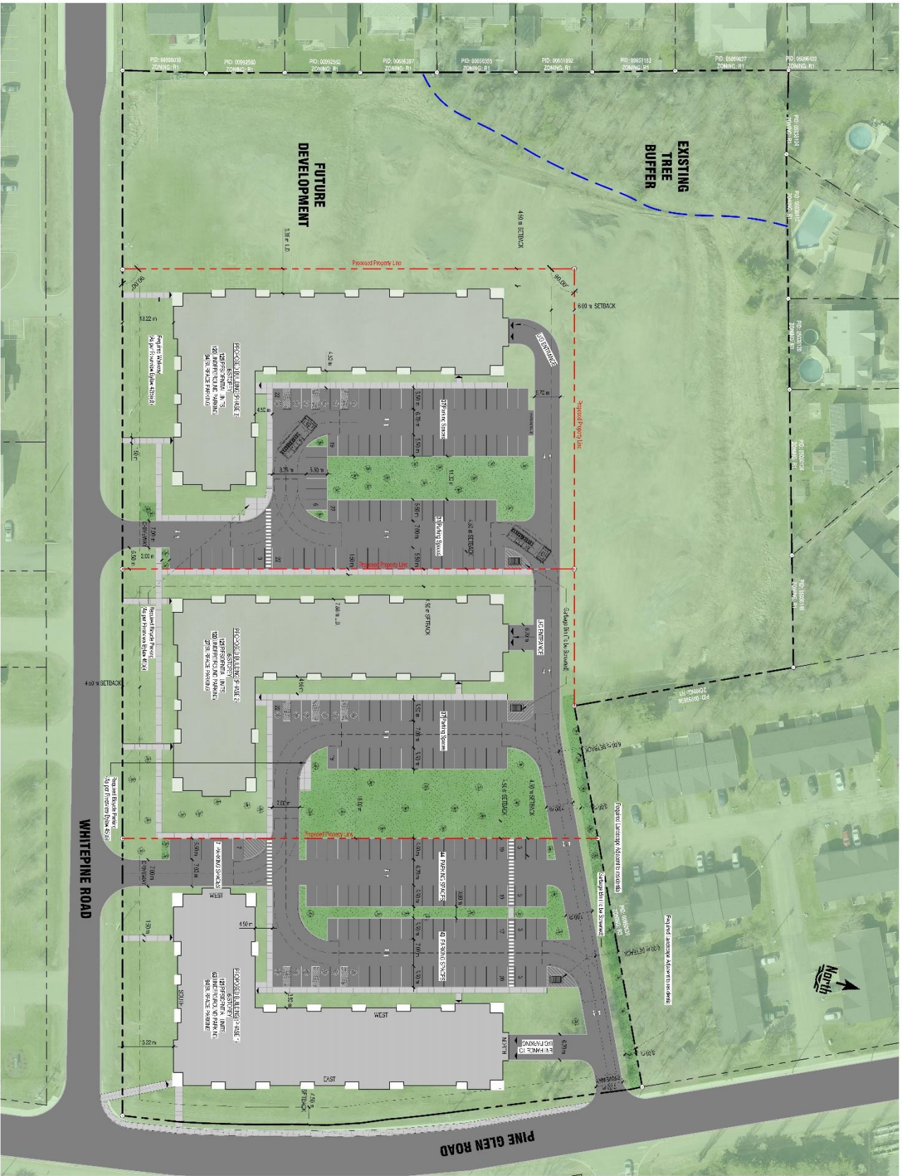
SITE PLAN 1" = 40'-0"