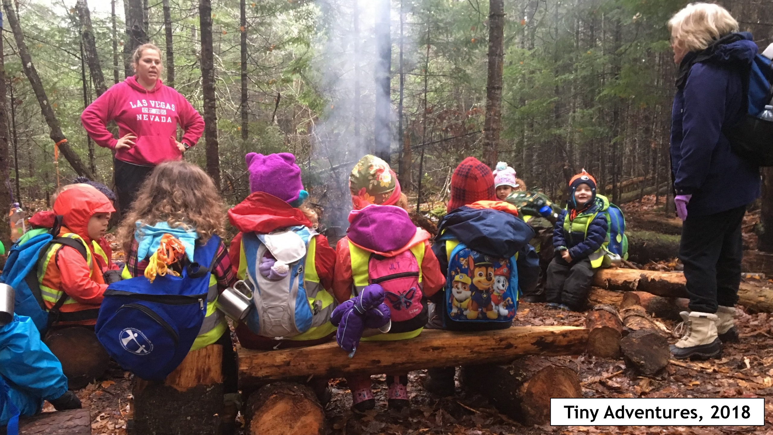
Tiny Adventures, 2018