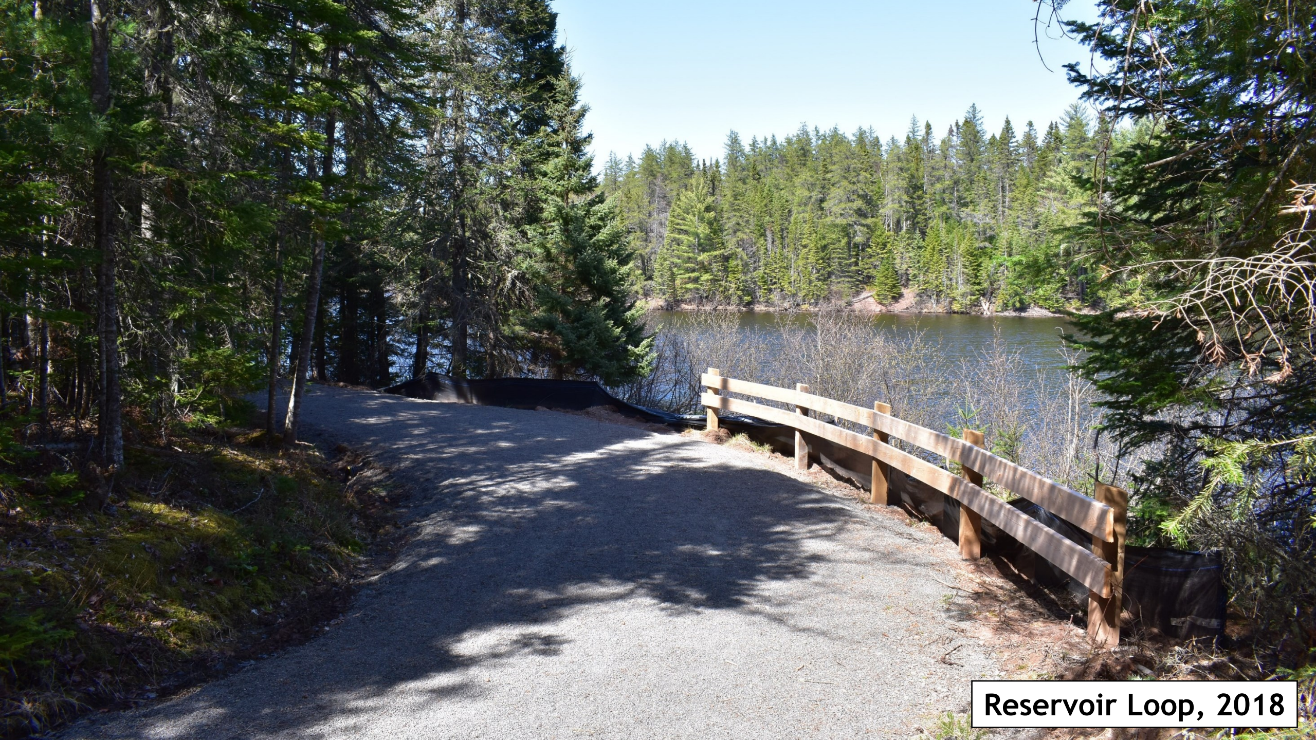
Reservoir Loop, 2018