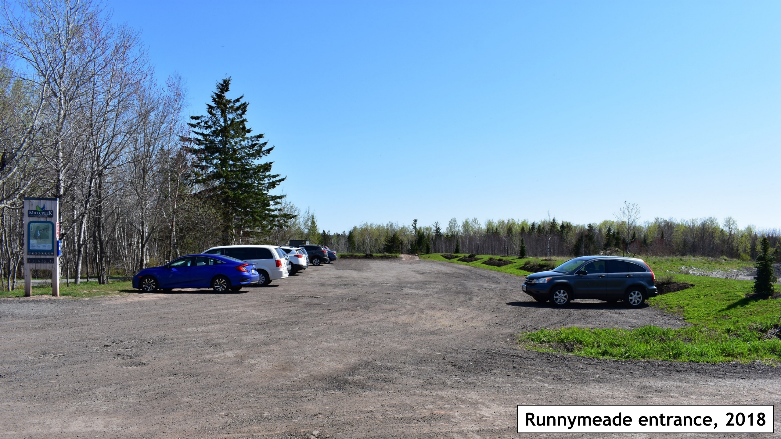
Runnymede entrance, 2018