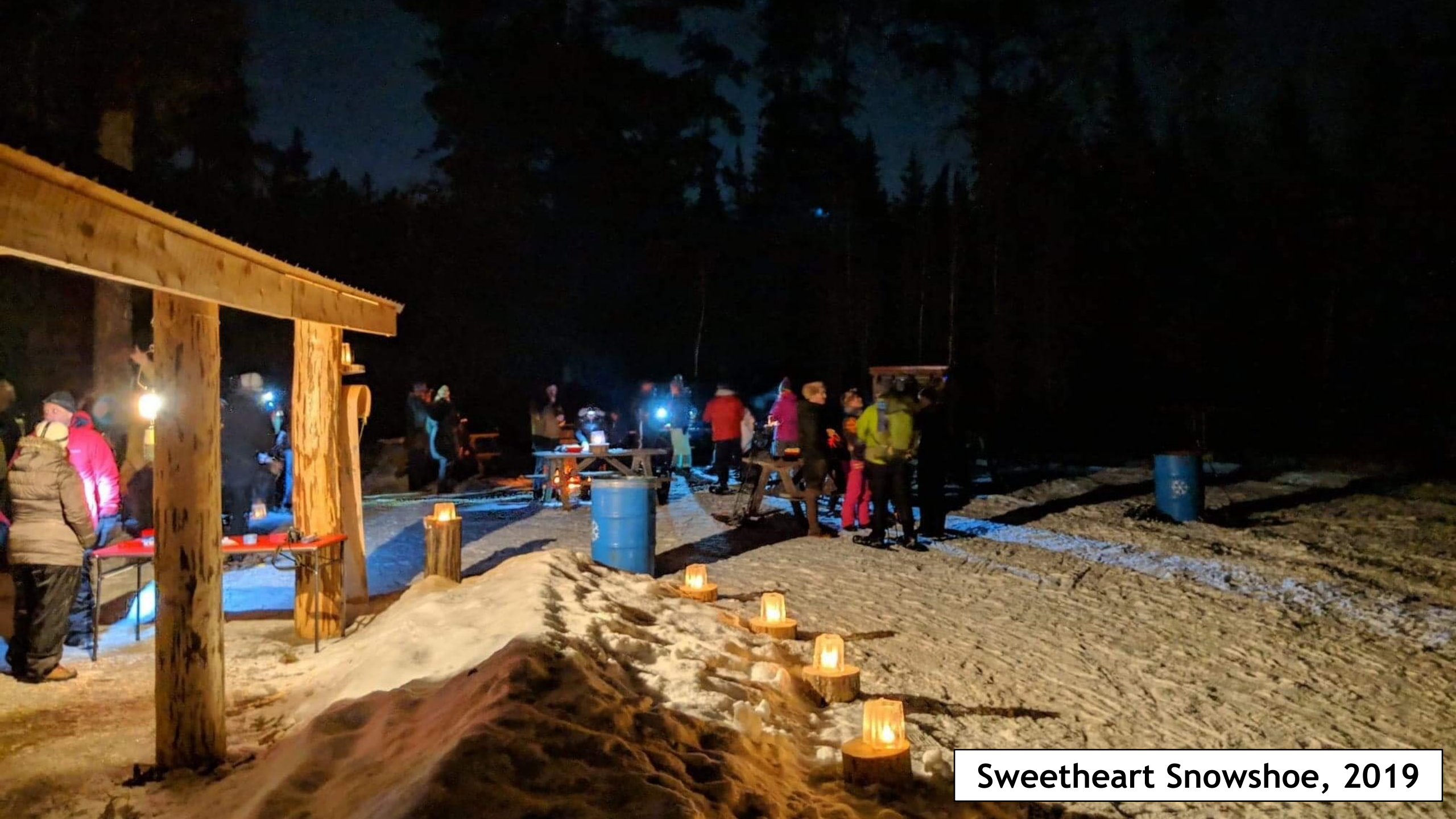
Sweetheart Snowshoe, 2019