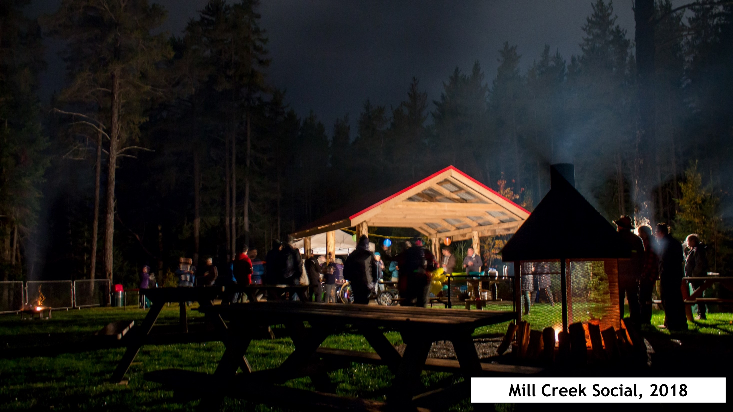
Mill Creek Social, 2018