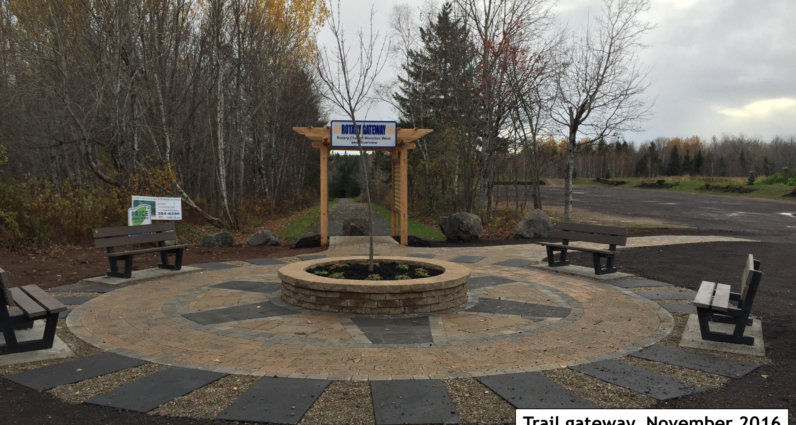
Trail gateway, November 2016