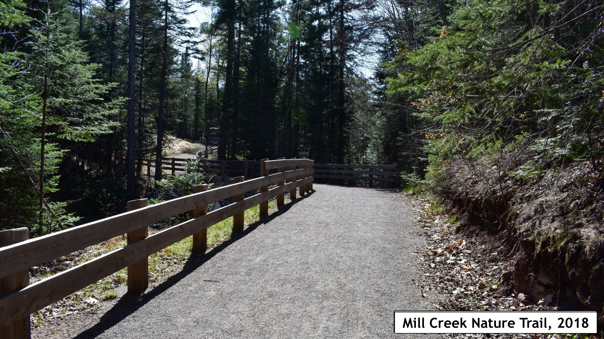
Mill Creek Nature Trail, 2018