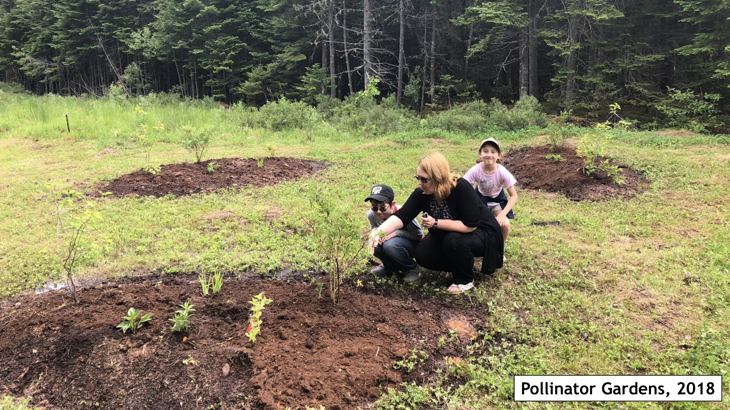
Pollinator Gardens, 2018